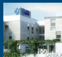
Hospital Viamed Santa Ángela de la Cruz