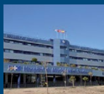
Hospital Madrid Norte Sanchinarro