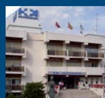
Hospital Madrid Montepíncipe