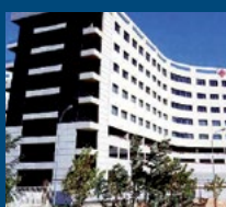
Hospital 9 de octubre