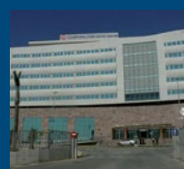
Hospital NISA Sevilla-Aljarafe