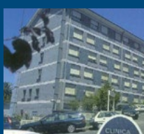
Clínica Virgen Blanca